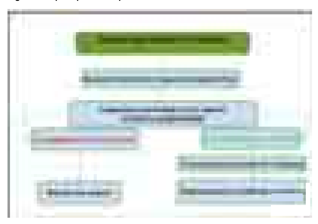
Figure 5: Export quarantine procedures