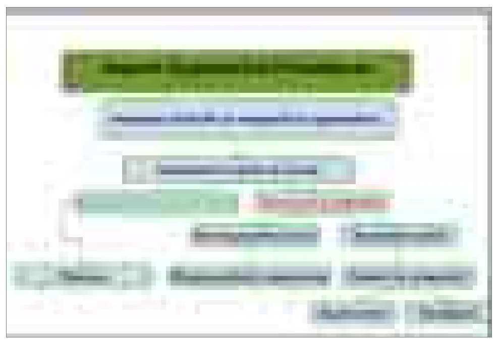
Figure 4: Import quarantine procedures