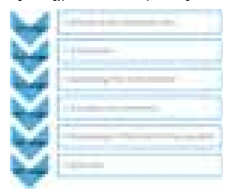
Figure 1: Egyptian standard development stages